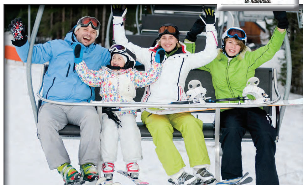
Blue Mountain Resort, Palmerton