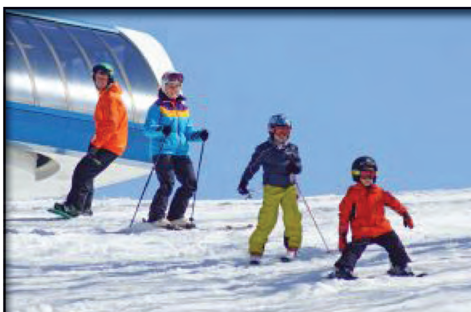
Shawnee Mountain Resort

Shawnee Mountain Resort, East Stroudsburg , Located in the Pocono Mountains, is an ideal beginner and family-friendly ski resort. Snowmaking covers 100% of all Shawnee's 125 acres of skiable terrain. The big news this season at Shawnee is a fully automated snowmaking system on the Delaware and Country Club trails and in both freestyle terrain parks. This is part of the resort's multi-year, multi-million-dollar snowmaking upgrade project. Shawnee has also purchased a new Pisten Bully 400 Free Grooming Machine this season to add to its impressive grooming capabilities. Additionally, the resort has added several new complimentary charging stations, so guests can charge their cell phones and tablets inside both the Hope and Trepp ski lodges. Finally, guests utilizing rental equipment are in for a treat this season with upgraded inventory including over 500 sets of Elan skis, 150 pairs of Dalbello boots, 100 Rossignol snowboards, 175 pairs of Burton snowboard boots and 220 adjustable helmets. For more information, visit, https://www.shawneemt.com .