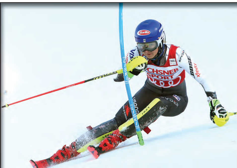
Mikaela Shiffrin won Saturday's FIS Ski World Cup Women's slalom in Levi Finland.