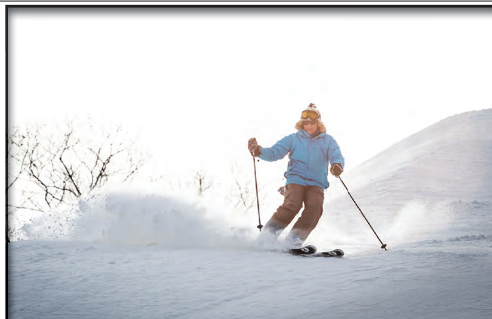
JFBB Jack Frost and Big Boulder Park