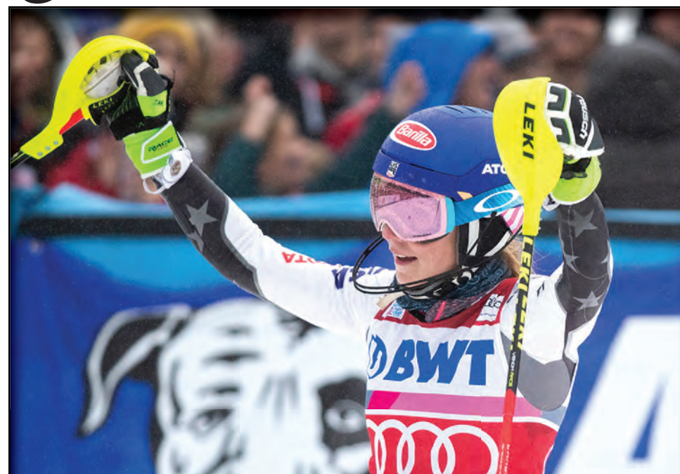
Mikaela Shiffrin won Sunday's FIS Ski World Cup slalom at Killington Resort.