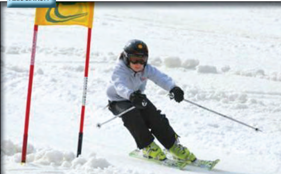
Bear Creek Mountain Resort