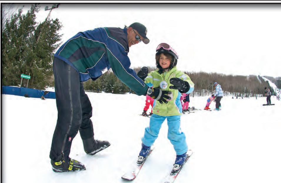
Elk Mountain Resort