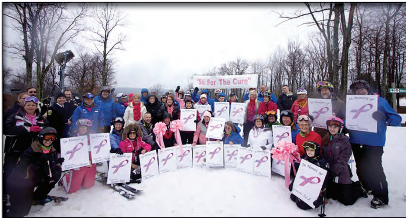
12th Annual JFBB Ski for the Cure, breast cancer awareness event that will take place February 23, 2019.

On Saturday February 23, 2019, JFBB will proudly present the twelfth annual “Ski for the Cure” Breast Cancer Awareness Day at Jack Frost Ski Area, Blakeslee Pa. The event culminates a month long campaign as February is declared Breast Cancer Awareness month at JFBB. The event benefits the local Chapter of Susan G. Komen for the Cure, Greater Pennsylvania. 100 % of the net proceeds are donated to the organization. 75% stays local in Northeast Pa, providing much needed breast health services for medically underserved and uninsured women and men in Northeastern, Pa. The remaining 25% will fund the Susan G. Komen for the cure National Research Grant Award Program.