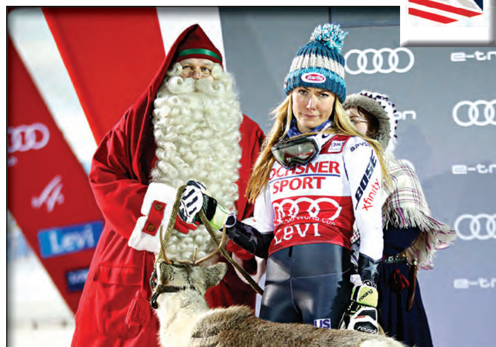
Shiffrin channeling her inner Gru (from the movie Despicable Me), as she poses with her reindeer "Mr. Gru."