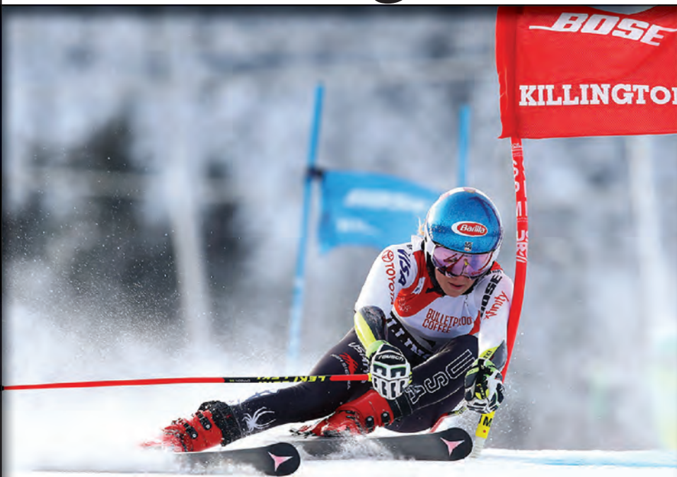
Mikaela Shiffrin arcs a turn in a more aggressive second run.