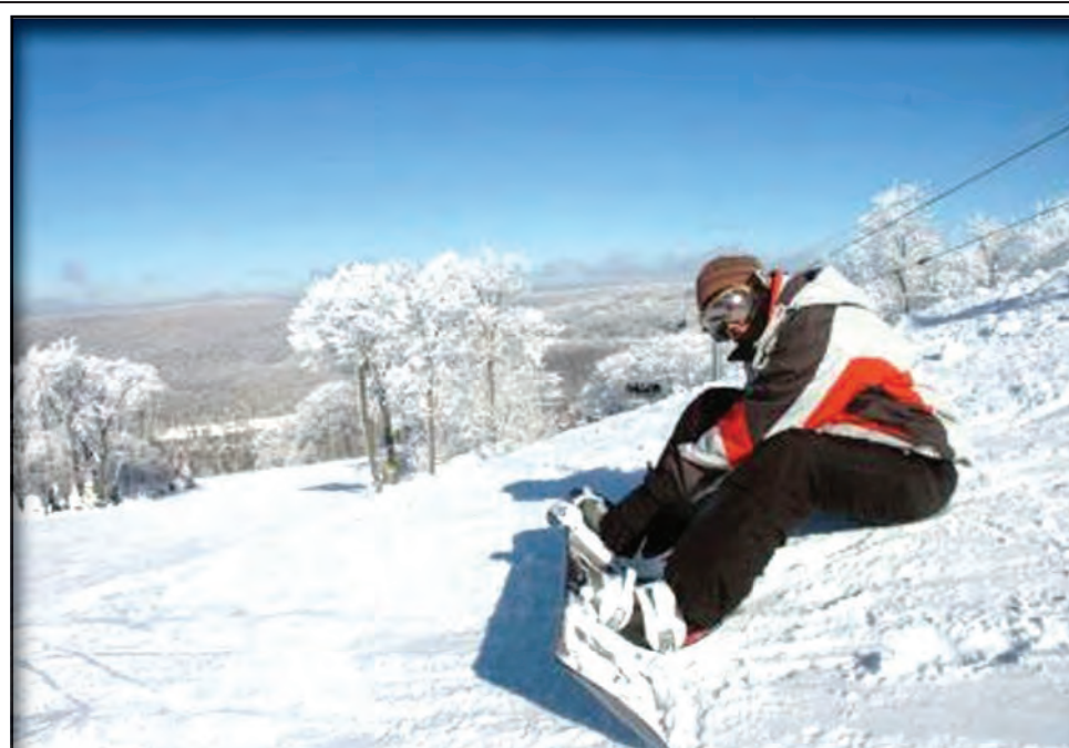
Seven Springs Mountain Resort