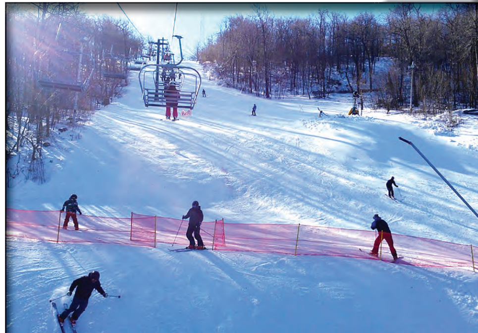
Blue Knob Mountain Resort