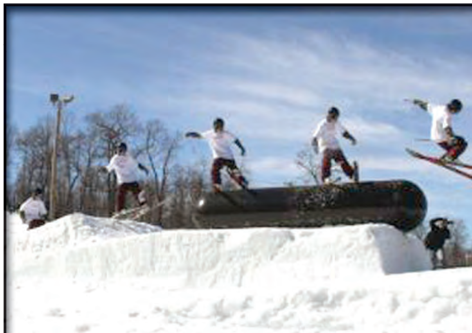
Roundtop Mountain Resort

Liberty Mountain Resort, Carroll Valley Located near historic Gettysburg, Liberty Mountain offers something for all winter sports enthusiasts from skiing, snowboarding and tubing to ice skating on the Alpine Courtyard Skating Rink.