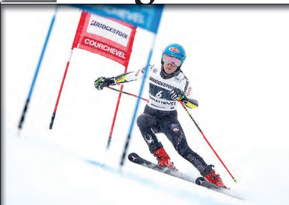
Mikaela Shiffrin won her first FIS Ski World Cup giant slalom of the season Friday in Courchevel, France.