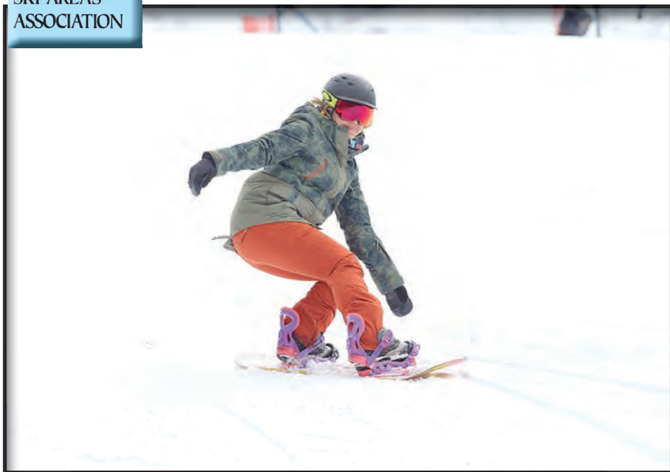
Shawnee Mountain Kids Ski & Snowboard School