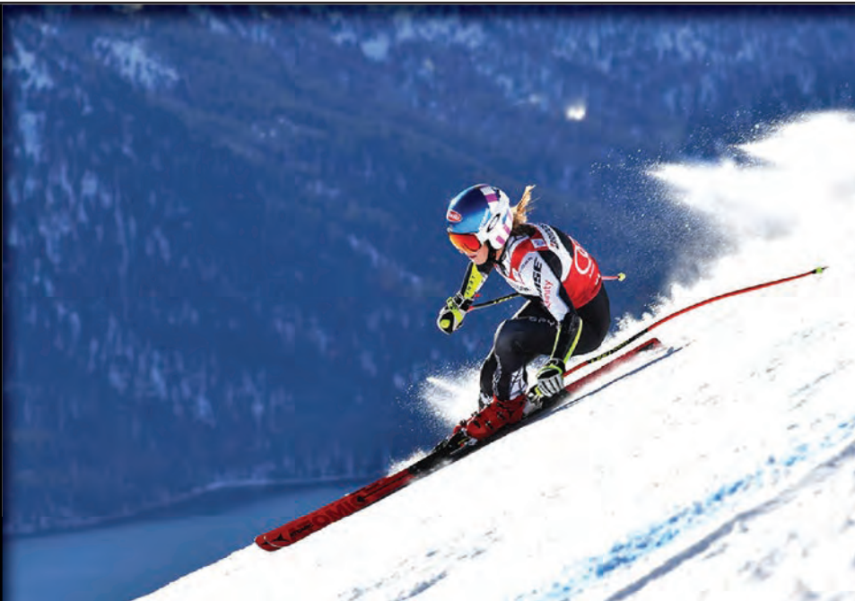
Mikaela Shiffrin won her second-consecutive FIS Ski World Cup super-G in Saint Moritz, Switzerland, Saturday.