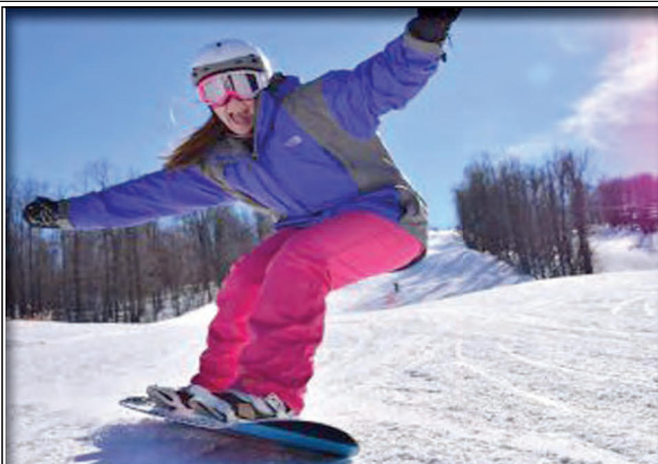
Hidden Valley Resort