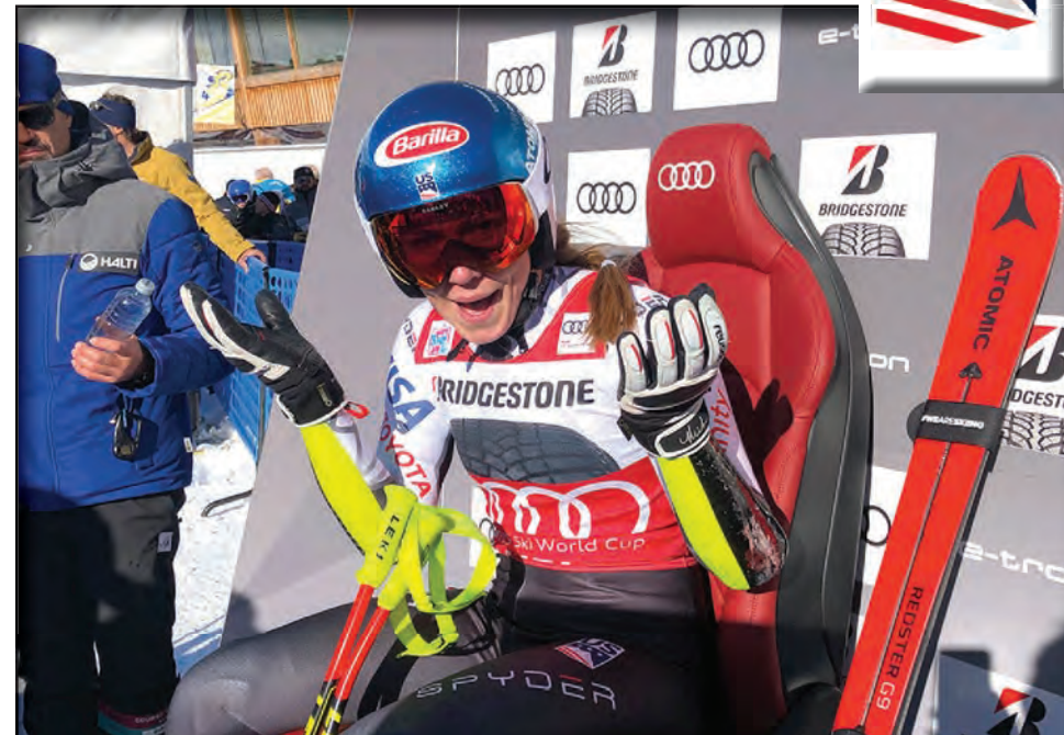
Mikaela Shiffrin is surprised to once again be in the "Hot Seat" in FIS Ski World Cup Super G