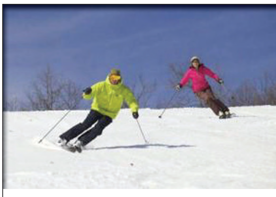
Whitetail Mountain Resort