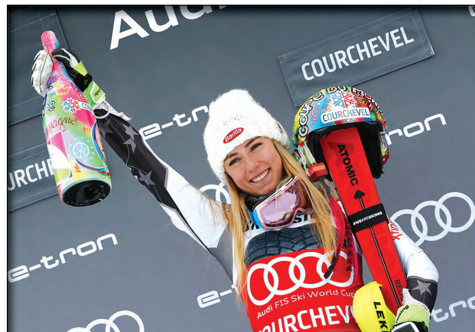
Mikaela Shiffrin celebrates her 50th FIS Ski World Cup victory following Sunday's slalom win in Courchevel, France.